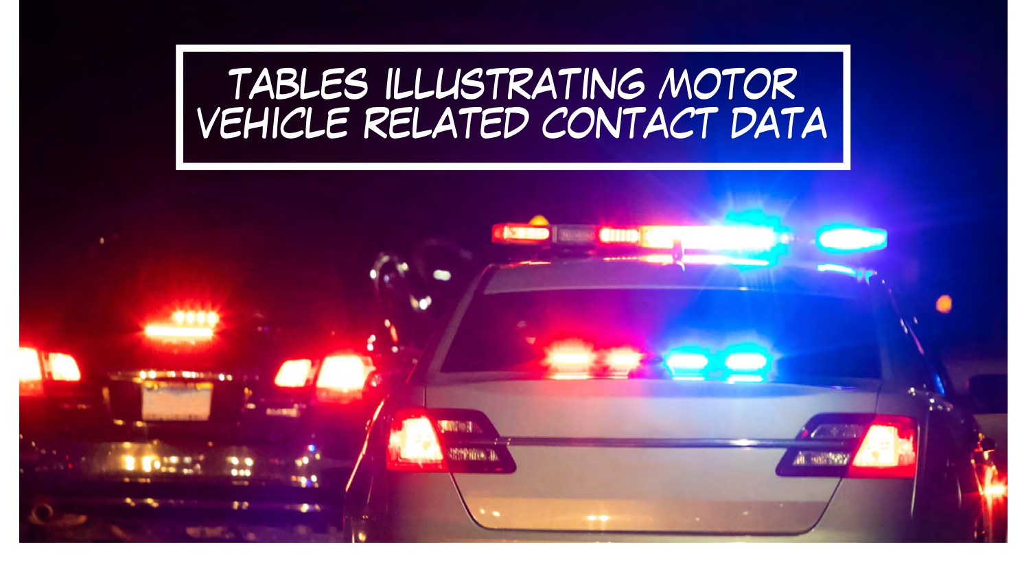
Table 1. Citations and Warnings